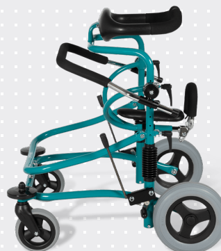
VELA Miniwalk str. 1

VELA Miniwalk is a gait trainer for children with mobility disabilities. It is available in two sizes for children at ages 1-7 years.