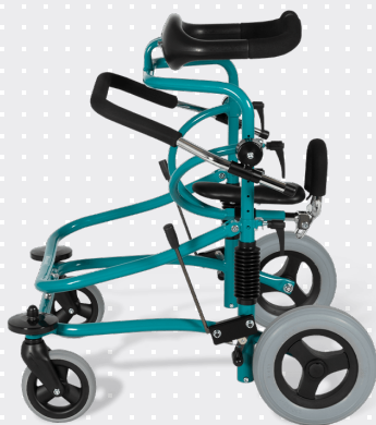
VELA Miniwalk str. 2