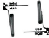
Flipaway Chest Laterals