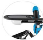
Tray with bowl insert