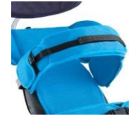
Chest Wraparound Harness