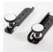
Extended Knee Brackets