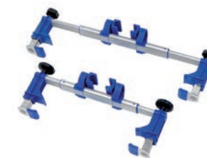
Retention clamp for PT Uni

UK plug, Art. No. 045 142 / USA plug, Art. No. 045 143 AUS plug, Art. No. 045 144