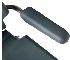
Armrests with soft padding