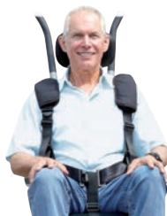
Range of belt systems

standard width 44 cm, extended to 54 cm Art. No. 945 146