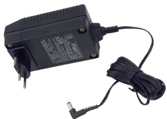
Mains charger unit BC-PT with Euro plug

Accessories for LIFTKAR PT stairclimbers are specifically designed to cater for the individual needs and requirements of people with walking difficulties. The quality of the technical solution and design are of the utmost importance.