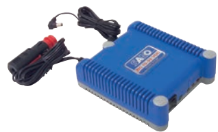
In-car charger unit BC 10-30 VDC-PT

weight 4.3 kg, capacity 5.2 Ah, voltage 24 VDC Art. No. 004 150