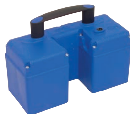
Quick-change battery unit BU PT 5,2 Ah

weight 4.3 kg, capacity 5.2 Ah, voltage 24 VDC Art. No. 004 150