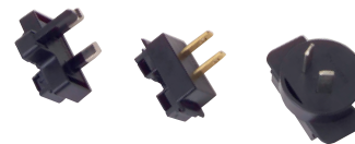
Charger unit adapter

5-point belt system, Art. No. 945 144 / Waist belt, Art. No. 945 118 / Waist/chest belt, Art. No. 945 158