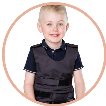
Somna Weighted Vest