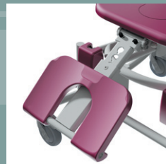
Ref. 5600.50 Leg support option