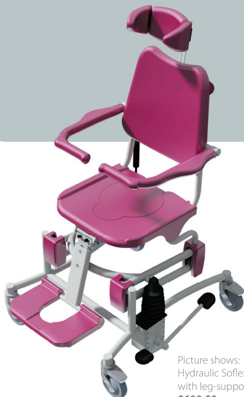
Picture shows: Hydraulic Soflex 5601.00 with leg-support Option 5600.50

The Soflex is a height adjustable commode and shower chair that makes hygiene procedures safe and comfortable for both patients and caregivers.