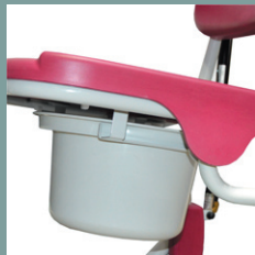
Ref. 5600.10 Pan option