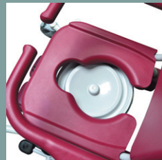
Moulded aperture seat