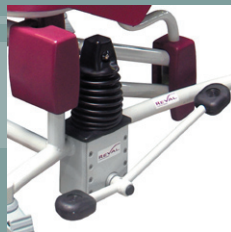
Hi/Lo hydraulic pedal