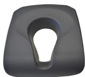
PRESSURE- RELIEF SEAT Art. No.: 330023