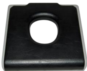
SEATPLATE with small hole Art. No.: 800178