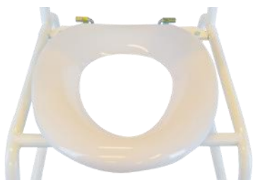
TOILET SEAT Art. No.: 330024