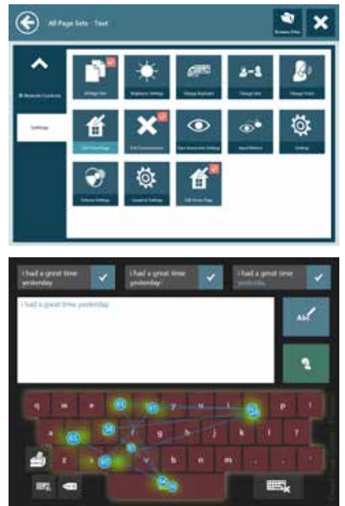
The "Quick Menu" gives caregivers access to the most commonly used settings and functions in Communicator 5. On the bottom right you can see the new "dwell-free" keyboard in action.