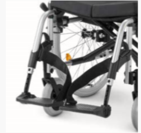
Detachable, swing-away legrests. Footplates angle-adjustable, incl. single calf strap.