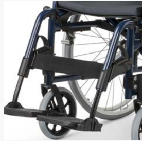
Legrests swing-away inwards and outwards